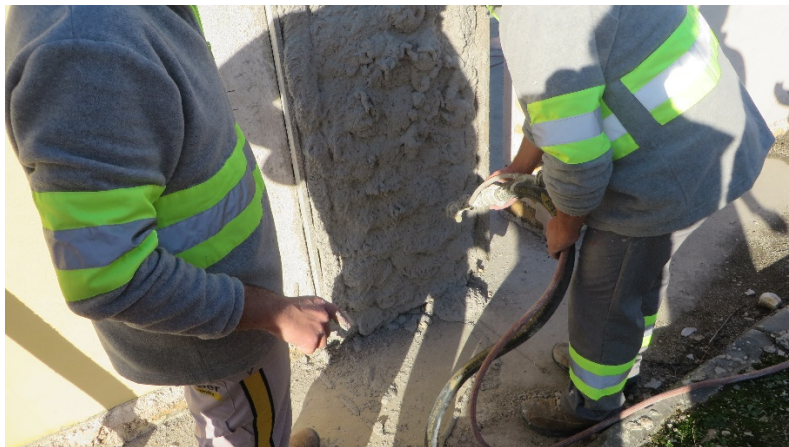
Testing on-site applications and mechanical spraying machine.

Indicators: 6 articles published; 1 national paper; 5 papers in international conferences; 5 papers in national conferences; one PhD Thesis - 36 months from the Portuguese Foundation for Science and Technology (FCT) - SFRH/BD/132239/2017 - Marco Pedroso; 2 MSc dissertations; 14 research reports.